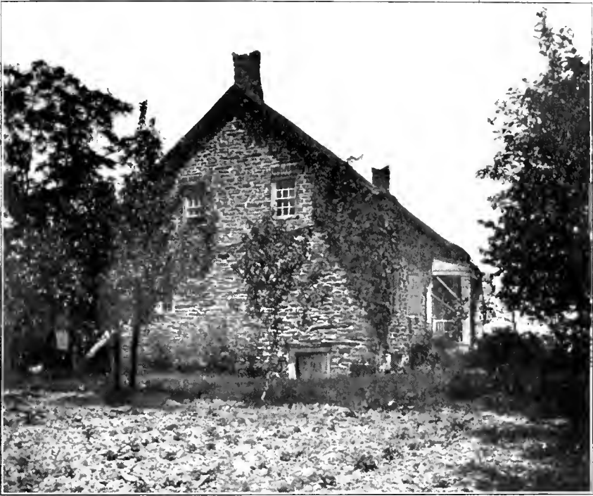
The Spoor Homestead near Cocksackie.